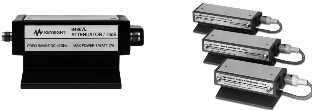
Figure 4. Programmable step attenuators.

Keysight programmable step attenuators offer fast, precise signal-level control up to 50 GHz, with switching time of less than 20 ms. Unmatched attenuation repeatability of less than 0.03 dB up to 5 million cycles per section ensures low measurement uncertainty and reduces calibration cycles when installed into test systems. Automatic GPIB/USB/LAN drive control is achieved with the 11713B/C attenuator/switch driver.