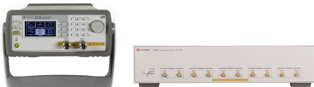
Figure 5. Attenuator control unit.